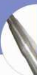
Super Pressure Tube Double-End Shrinking and Expanding Machine HC-66-01