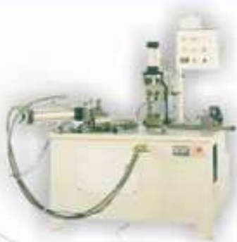
HC-04-01F Joint Arc Punching Machine