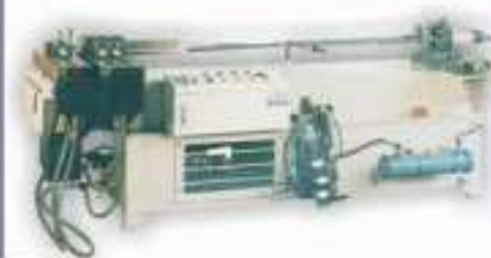
HC-04-11 NC Bender