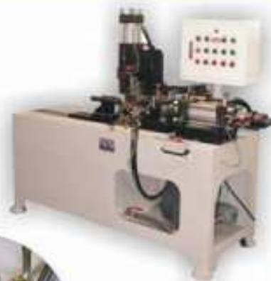
HC-17-16A Vertical Type 3-Mold Tube-End Former