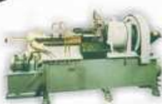
Horizontal Type 3-Mold Tube End Former HC-17-12B